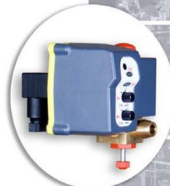
Optional - Auto drain Valve