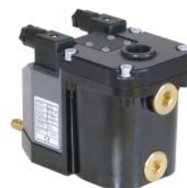
Multiple inlet options