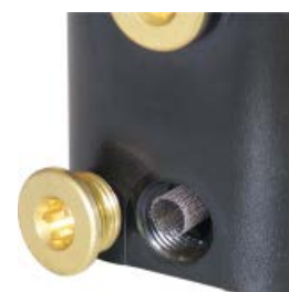
Integrated mesh strainer protects the valve against large contaminants

*A1 = Normally open contacts, closed when in alarm phase. LED on the drain is OFF when in operation and ON when in alarm mode. A2 = Normally closed contacts, open when in alarm phase. LED on the drain is ON when in operation and OFF when in alarm mode.