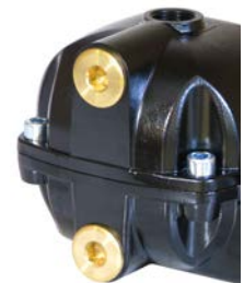
Three inlet options for easy installation