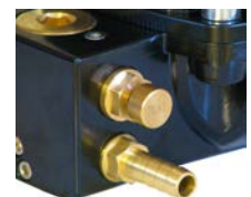
TEST button feature for routine testing