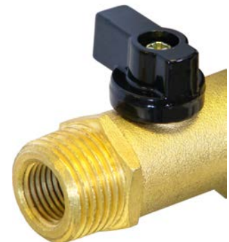
Dual inlet feature 1/2" & 1/4"