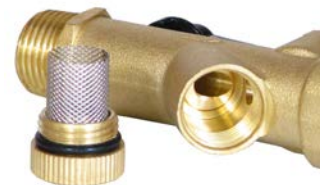
Integrated mesh strainer

JORC is NEN - EN - ISO 9001:2015 certified